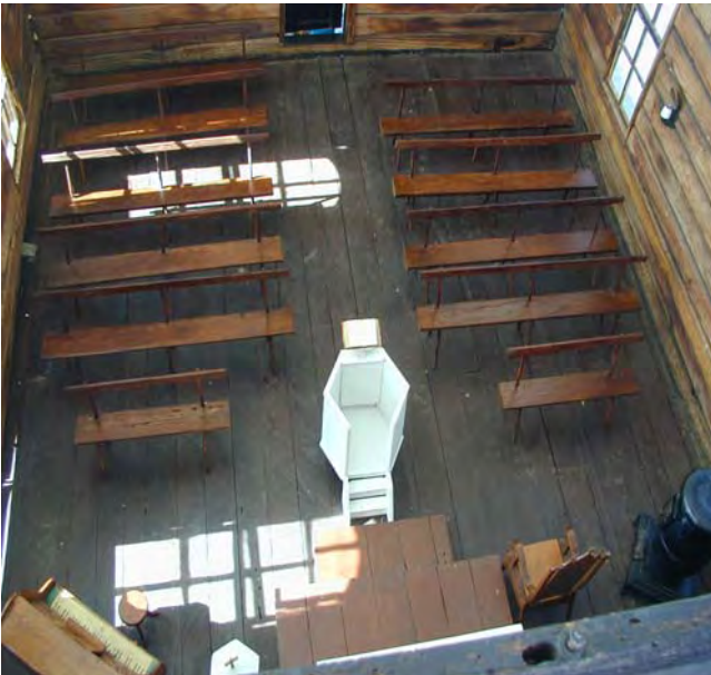
Base setup and furniture placement